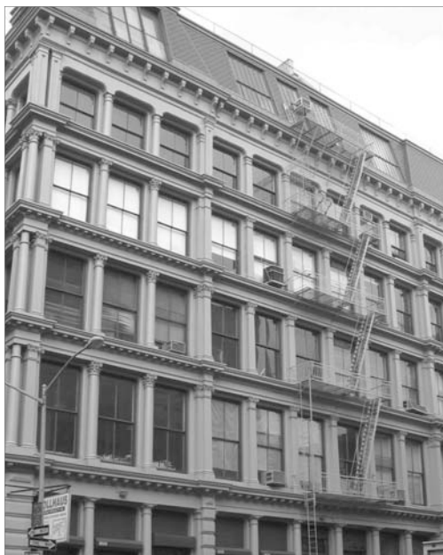
134-40 Grand Street, a splendid building in the proposed Extension.