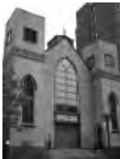
Synagogue Beth Hamedrash Hagodol

Discover a collection of Victorian-era synagogues surviving in a rapidly gentrifying neighborhood that was once a teeming immigrant enclave. See synagogues that still function as houses of worship and others that have been converted to a variety of uses. Visit the historic Eldridge Street synagogue currently complet-