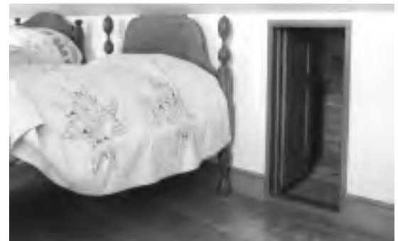
Cubbyhole that hid fugitive slaves making their way to freedom on the Underground Railroad. The doorway was no higher than the bedstead.