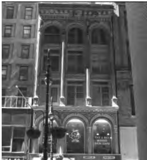
Designation as an individual landmark is being sought for 63 Nassau Street, a cast-iron-fronted building between Maiden Lane and John Street.

In recent months the Chapter has also supported designation of the Van Tassel & Kearney Horse Mart at 126-28 East 13th Street and two 1890s stables on the Upper West Side in Manhattan. One stable, the New York Cab Company building at 318-30 Amsterdam Avenue was designated a landmark by the Commission. The other, the Dakota Stable at 348-54 Amsterdam, was removed from consideration for designation. Testimony in favor of designating the warehouse at 23-25 Park Place in Manhattan was given in January. The Chapter also supported designation of a new district, Crown Heights North, in Brooklyn and individual landmarking for the James & Lucy Elwell House at 70 Lefferts Place in Clinton Hill South, Brooklyn and the Rutan-Journey House at 7647 Amboy Road in Tottenville, Staten Island.