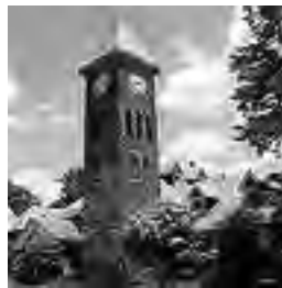
Doris Duke Estate

This all-day bus tour explores four amazing gardens of New Jersey, beginning with a guided tour of the magnificent greenhouse complex on the Doris Duke estate in Somerville. Participants will enjoy the Cross Estate gardens, an early 20th century landscape on the grounds of the Morristown National Historic Park and the spectacular Greenwood