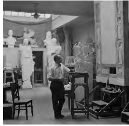
Paul Manship in his studio

After training in Europe, some of America's