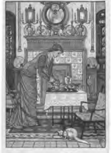
My Lady's Chamber by Walter Crane