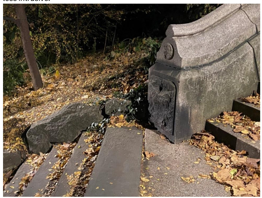
Note the brilliant transition between formal and rustic and the way Vaux cut the boulders to fit the stair treads.

Positive report 8-0 (Goldblum and Jefferson recommended a single center handrail).